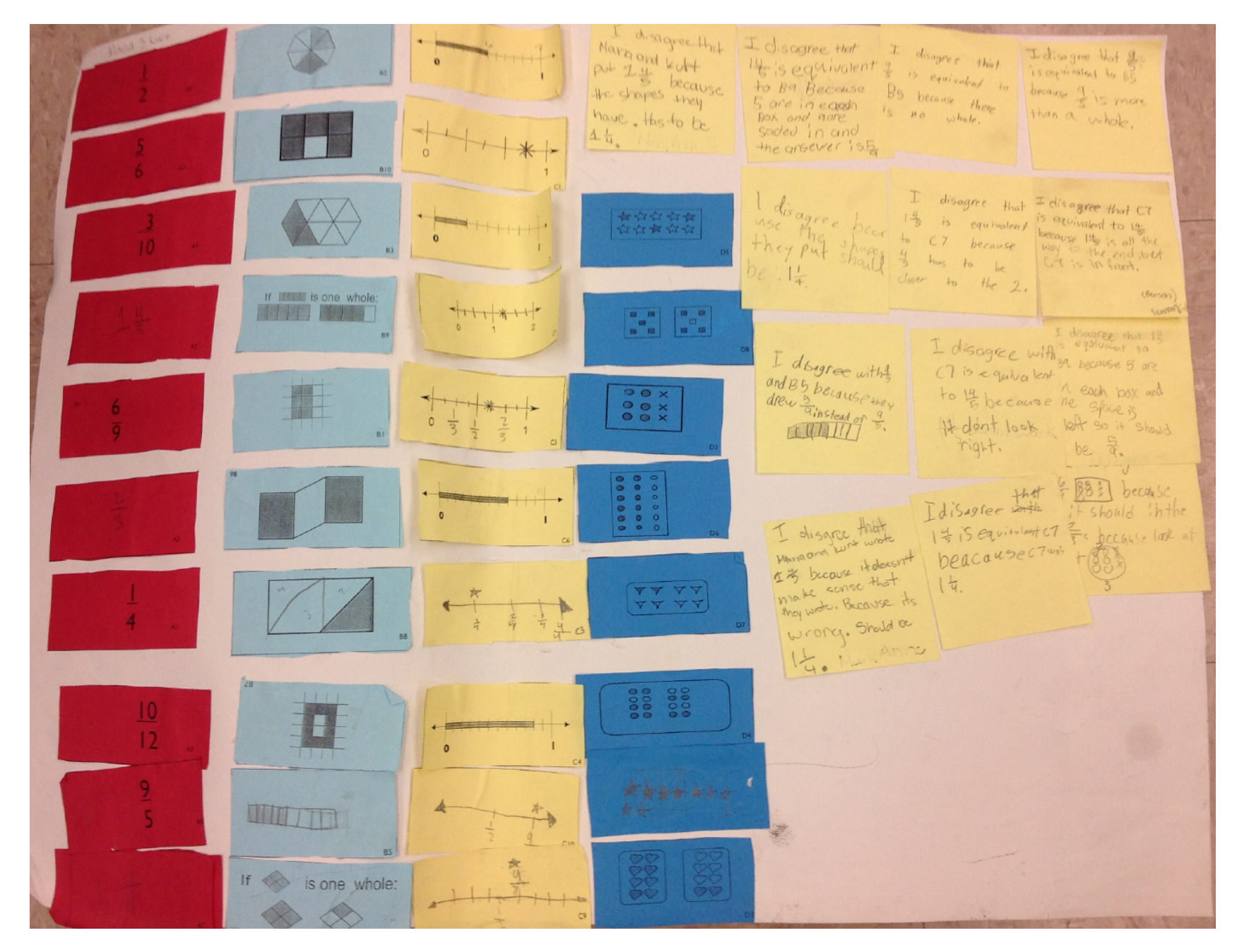
This material accompanies a videotaped lesson on Inside Mathematics (<u>www.insidemathematics.org</u>): Interpreting Fractions: Formative Re-Engaging Lesson. Austin, Texas: the Charles A. Dana Center at The University of Texas at Austin.